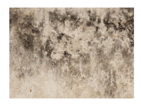
Walls, ceiling, floors & soft furnishings quickly show signs of black mould growth.