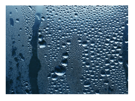
The 'average' family produces approximately 27 pints of moisture per day.

Instead, continuous running extract fans in bathrooms, kitchens and utility rooms work with the natural air flow in the house meaning you have a constant supply of fresh air which prevents germs multiplying and spreading, giving you a healthy home, but without the heat loss associated with intermittent fans.